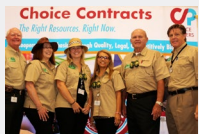
Choice Partners Vendor Exhibit p. 4