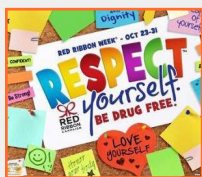
Students Participate in Red Ribbon Campaign p. 5