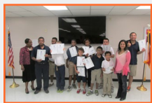
Academic and Behavior School West Recognizes Students for Honor Roll, Perfect Attendance p. 5

It's hard to believe that we're nearing the end of the month of October. The first semester of the academic year is more than halfway over. We hit the ground running and have maintained our momentum.