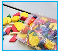
Hands-on Math Activities Help Teachers Understand New Math TEKS p. 3